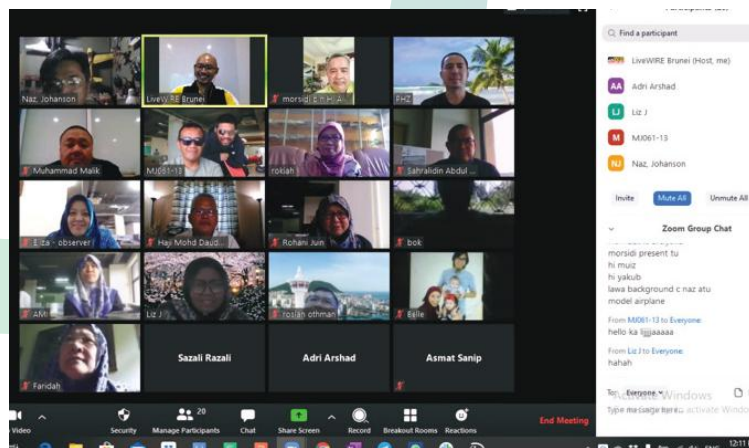
Others who participated from home.

Learning from experts and those who have the knowledge and skills in their field is extremely beneficial – both for personal and professional development. All Nex.Us associates are highly encouraged to participate in future trainings or workshops to elevate your skills and knowledge, or simply to learn something new while you re-discover your career plans in Nex.Us.