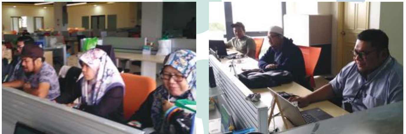
Some of the staff who participated in the online workshop together at the Nex.Us Headquarters