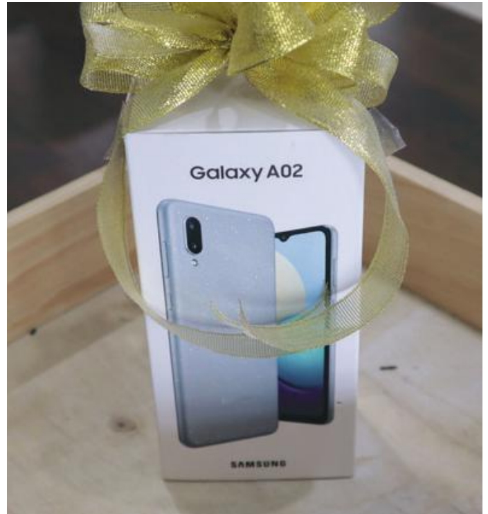
Hadiah yang dimenangkinya Her winning prize

Nex.Us Tech ditubuhkan tahun lalu dan menyediakan perkhidmatan antaranya pemasangan jalur lebar berkelajuan tinggi ke rumah-rumah, pembaikan dan penyelenggaraan kemudahan rumah dan baru-baru ini pemasangan tangki air, pam dan penapis yang lengkap untuk pelanggannya.