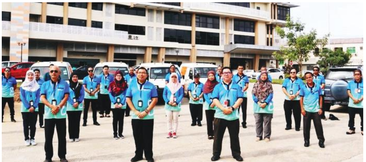
Pasukan Nex.Us Tech Sdn Bhd ketika baru ditubuhkan tahun lepas The Nex.Us Tech Sdn Bhd team when it was first formed last year

Nex.Us Tech was formed last year and provides services ranging from installation of home broadband, home improvement and facilities maintenance and more recently a complete installation of water tank, pump and filter for its customers.