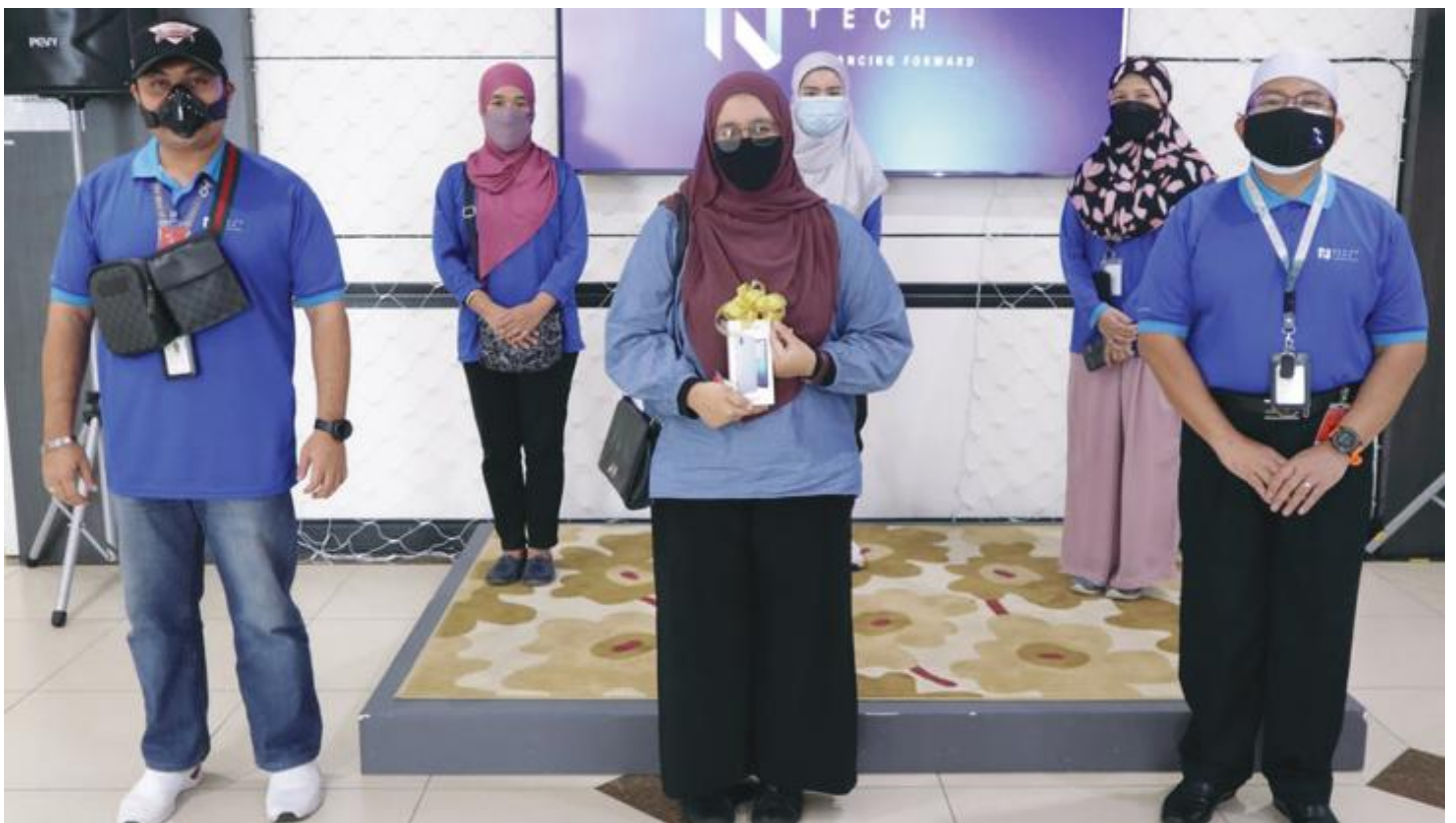
Pemenang bergambar ramai dengan kakitangan Nex.Us Tech Sdn Bhd The winner in a group photo with Nex. Us Tech staff