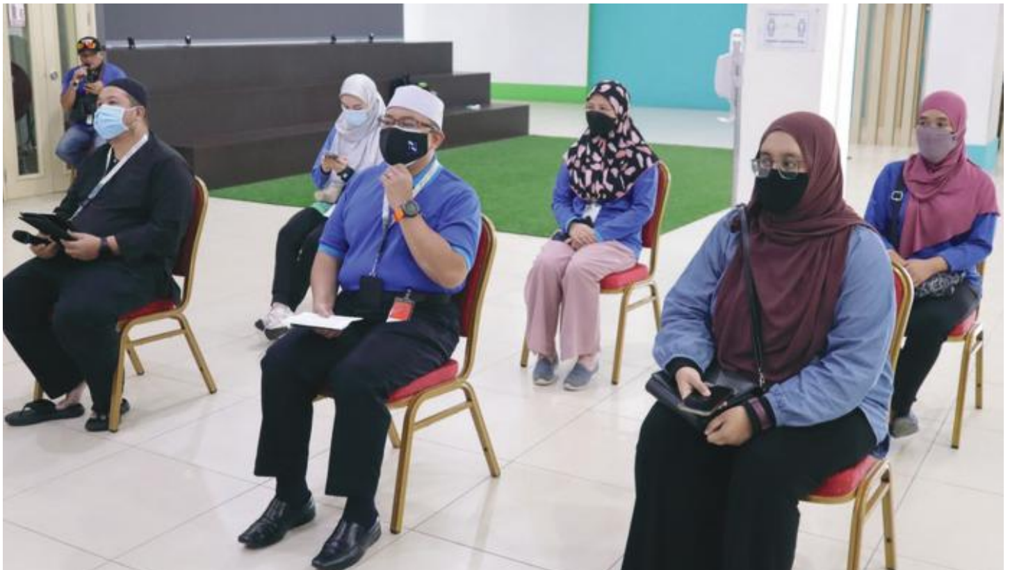
Majlis ringkas penyampaian hadiah anjuran Nex.Us Tech A brief prize presentation ceremony organised by Nex. Us Tech